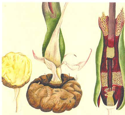
Voodoo lily, Typhonium venosum , watercolour, 1796, Thomas Hardwicke collection

This conference ran alongside the UN Convention on Biological Diversity meeting, serving as a platform for discussion on planning a museum on Indian biodiversity. Conference organisers recognised the need to bring together practitioners and researchers across the disciplines, resulting in an acknowledgment of the sciences, arts and humanities as interwoven rather than as disciplinary silos. This stimulated approaches to representing biodiversity, where traditional and cultural knowledge – exchanged through word of mouth and the printed word – are considered an operative part of India's environmental protection and care. A number of talks used traditional knowledge as a springboard for discussion on how to manage and curate botanic gardens and museums.