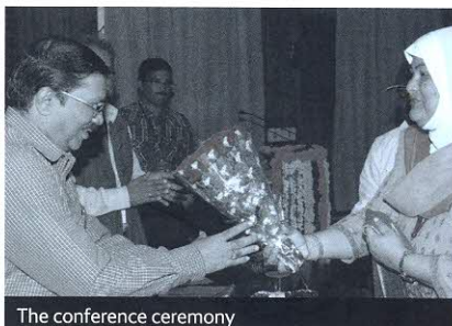
The conference ceremony